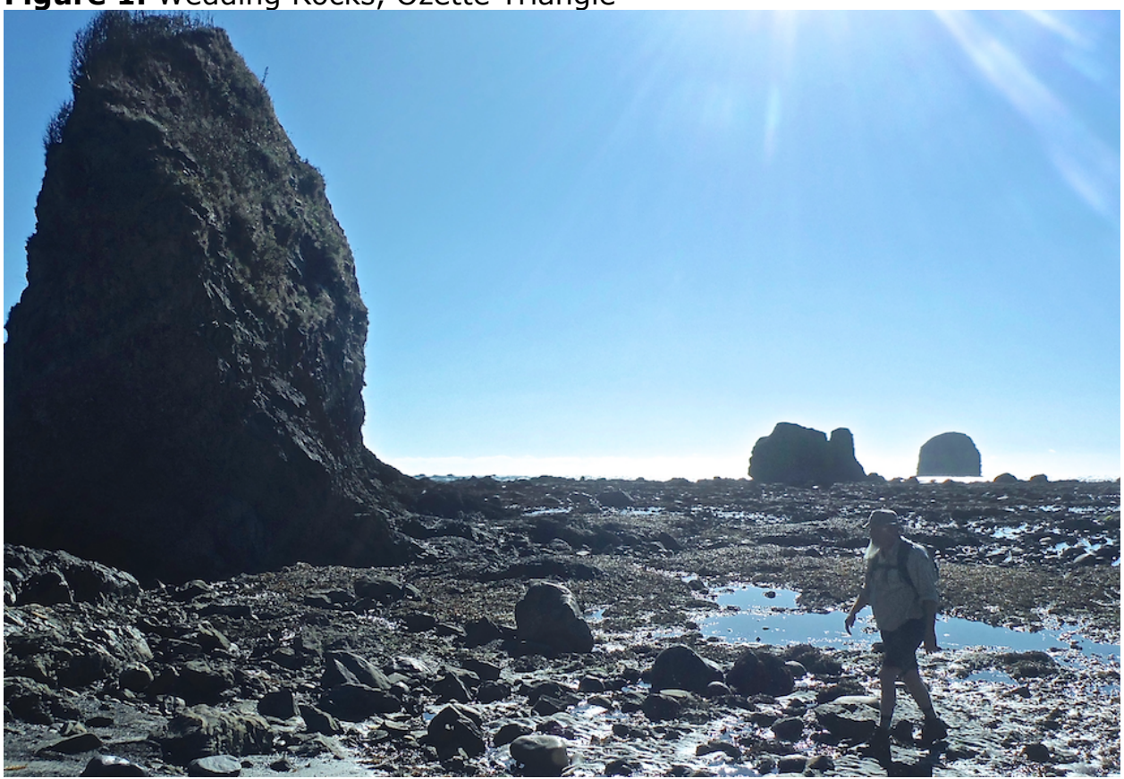
Figure 1. Wedding Rocks, Ozette Triangle

Once we reached the Wedding Rocks beach section, we dispersed to explore and discover the petroglyphs. This is an area where you do not always have visual contact with everyone, as there are many sea stacks and rocks. When everyone had seen enough, we found we were missing one hiker. As we looked south, our direction of travel, we saw that the missing member had gone ahead, so we continued toward Sand Point where a junction takes you into the coastal forest leading back to the trailhead.