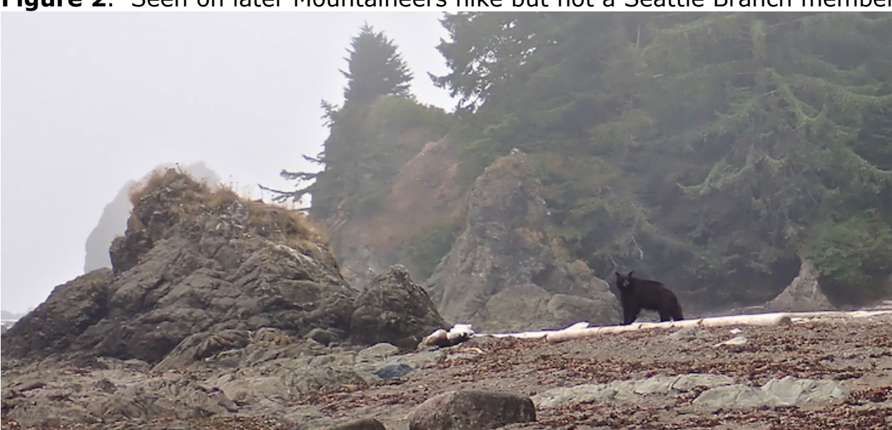
Figure 2. Seen on later Mountaineers hike but not a Seattle Branch member

I then backtracked to the original dispersal site to look for the third member But did not see her. I radioed the group that I did not locate her and was returning to their location. As I was returning, one of the members in the group radioed me that they saw the third member through binoculars south beyond the meeting area. I returned to the group and we soon reached the third member.